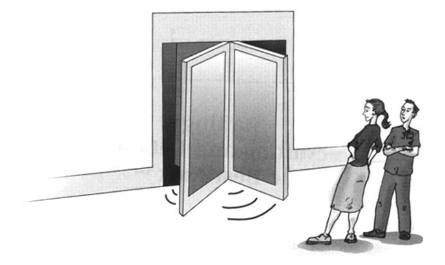
FIGURE 9.1 "Is this the door to the ER? No, it's the door to HR. The nurses go in and out so fast you can't even see them."

trous. As one physician told us, "He cut back staff mercilessly, especially in nursing. The hospital looked more profitable, but it was dangerously understaffed.... Everyone felt demoralized.