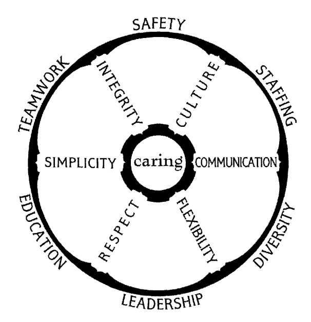
FIGURE 1 The Smart Nursing model.

Too many health care organizations are using short-term fixes— Band-Aid solutions—that exacerbate the nursing shortage. It is longterm strategies, Smart Nursing strategies, such as building relationships and effective communication that deliver better results.